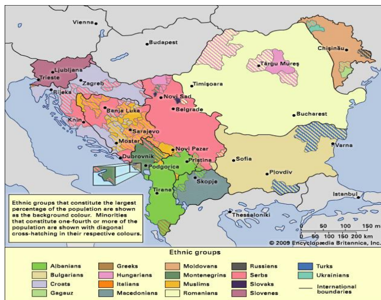
Figure 1: Balkan ethnic distribution