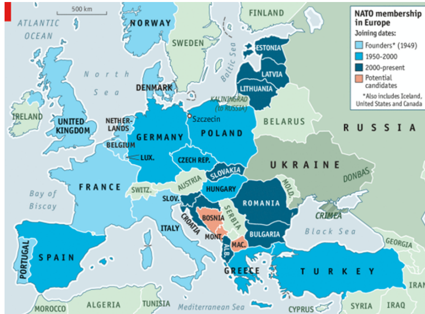
Figure 3: NATO membership in Europe